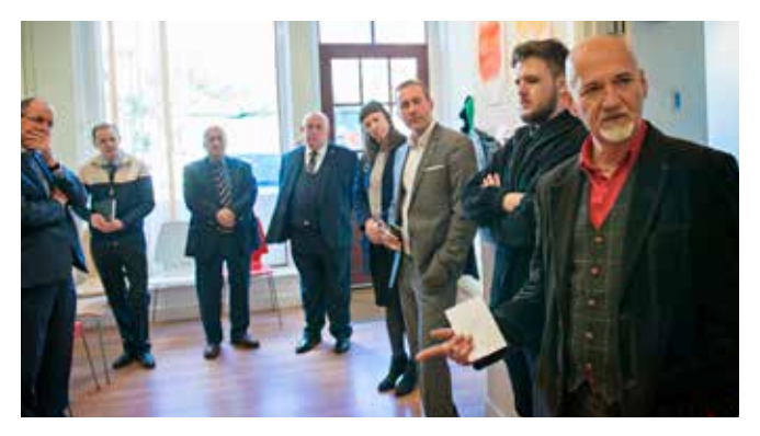
Working Rite launch – April 2018.