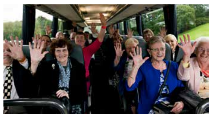
Queensland 50th Anniversary.

Pollokshields Community Hub:- again a £2m project with funding from the Big Lottery Fund, Glasgow City Council/Scottish Government and SHA's own contribution. However this project has been paused due to our original partner and anchor tenant withdrawing from the project.