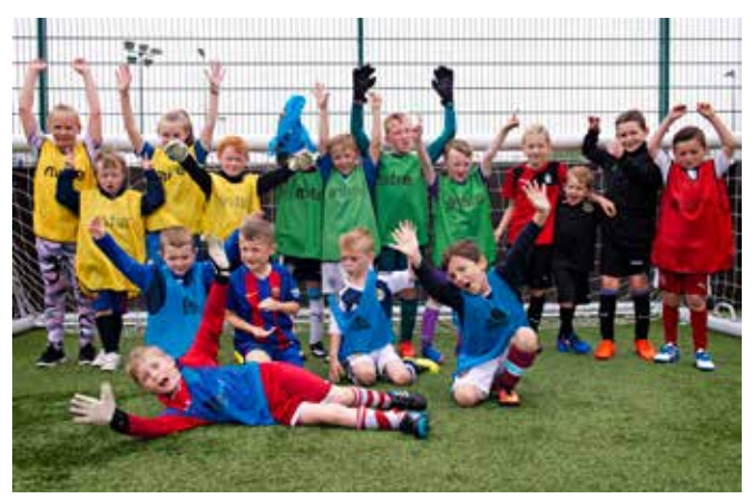
Last July over 30 local youngsters enjoyed a Summer Football Camp hosted by Glasgow City FC.

The Association continues to develop new housing to meet the general demand for good quality affordable housing and to also help the Council tackle homelessness. Details of our current housebuilding programmes are reported on below. The Management Committee approved a Funding Plan for £25m in November 2017. We hope to finalise details of this loan finance in September.