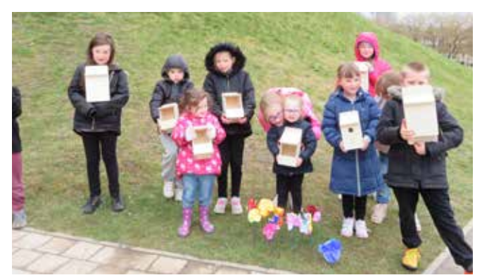
Bird Box making at 'Smiley Saturdays'.