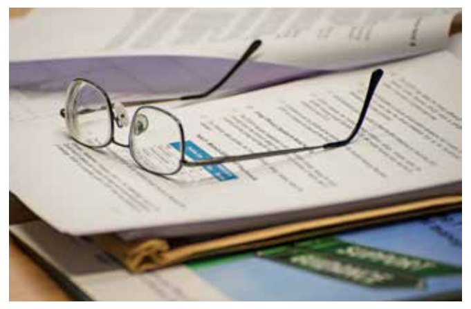
The Management Committee is elected annually by the Association's membership.