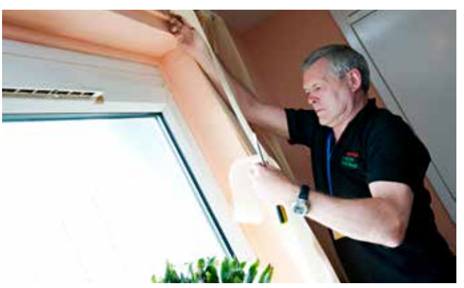
The volunteer Handyperson Service is a highly valued service.