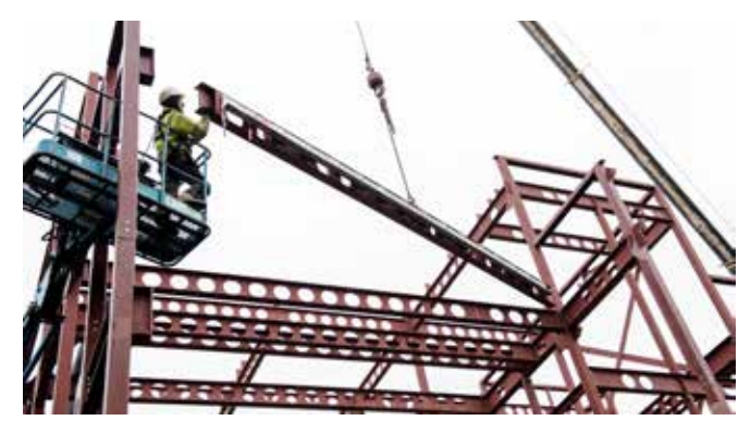
Work progressing at new homes in Pollokshields.