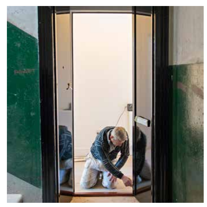
Private Acquisition Flats were refurbished at a cost £1.1m last year.

In addition to the projects that are currently on site, we hope to begin the demolition of Phase 2 of St. Andrews Drive Deck Access flats this summer, with a view to achieving tender approval for Phase 2 of the new build programme by the end of 2018/19.