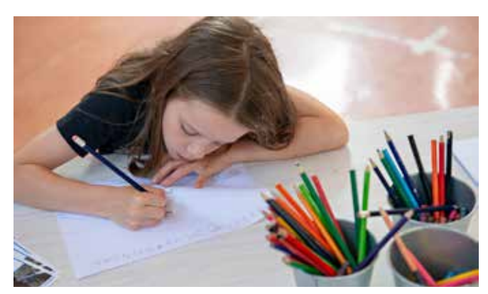
Southside Summer Connections.