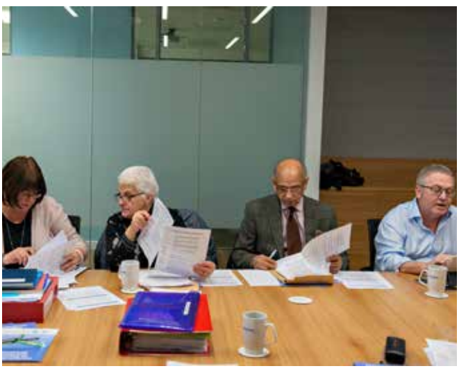
Attendance Rate at Management Committee meetings was 72%.