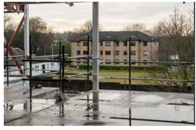
St Andrews Road Phase 1 New Build - 49 new homes due on site in late 2018.