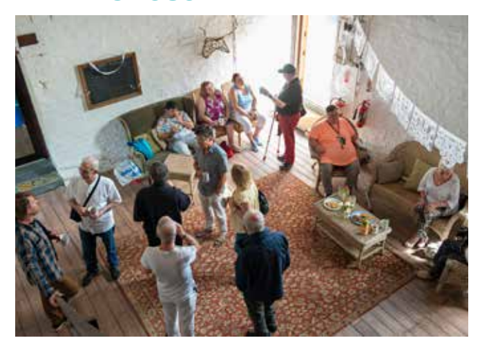
Volunteers at an "Away Day" - with support from the Big Lottery Fund we recruited and trained volunteers to support the Advice Team

The Advice Team provided 32 Tenancy Sustainment Starter Packs for new tenants who were previously homeless. We also supported households with paint packs and carpet vouchers. In addition the team provided support to 12 tenancies to replace essential items including white goods and beds. The team also supported 154 applications to the Scottish Welfare Fund to provide furniture, carpets and white goods, and to provide emergency grant payments to clients in destitution.