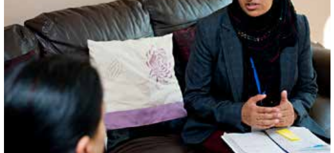
Saffron Project is a registered housing support service.