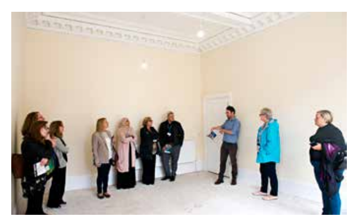
Site visit to the completed refurbishment of 553 Shields Road.