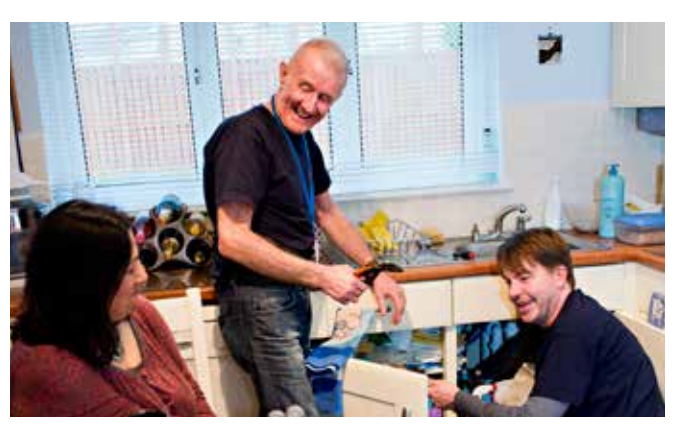
The Handyperson Service carried out 5579 jobs for clients in 2017/18.