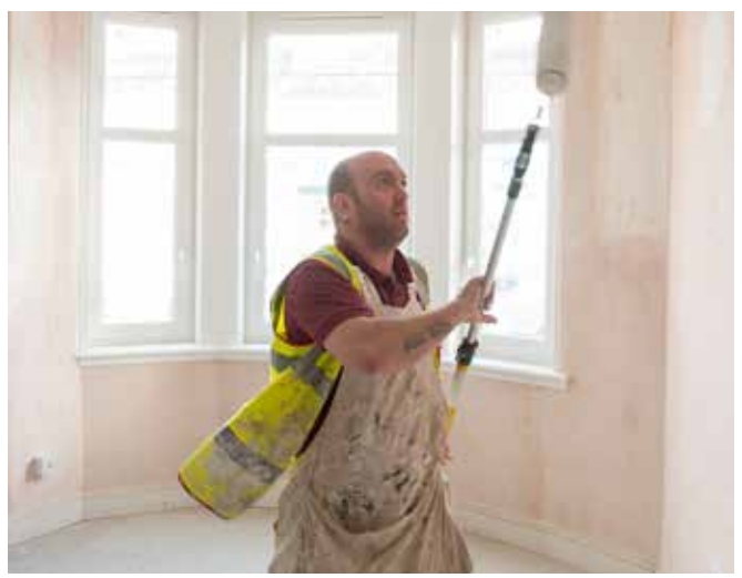
Work progressed in refurbishing private acquisition flats for social renting and mid market rent.