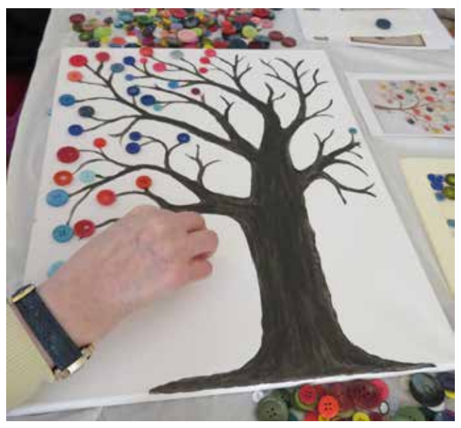
Arts and Crafts at Herriet Court, Pollokshields.