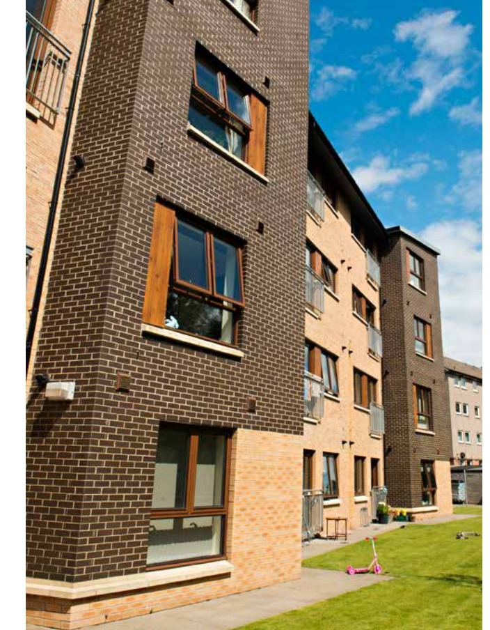
Southside Letting successfully negotiated a five year extension to the lease for the Mid-Market Properties in Tantallon Road.