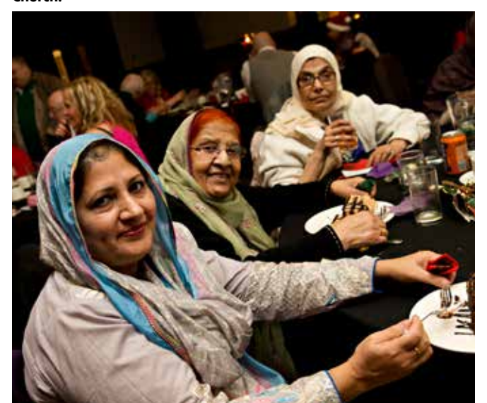
Pensioner's Party December 2017.