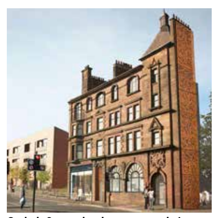
Gorbals Street, development completion date spring 2019.

In the past year the provision of Mid-Market Rent (MMR) through Southside Letting has increased from 90 to 114 units, an increase of 27%. In addition to this direct provision of Mid Market rent through wholly owned properties (the assets are owned by the parent company Southside Housing Association), Southside Letting also provides a letting service to private landlords. In the past year Southside Residential successfully negotiated a five year extension of the lease on 24 Mid Market Rent units owned by CCG Ltd., and has a further lease in place with one other private landlord. We expect to see an expansion in this relationship with private landlords in the coming year.