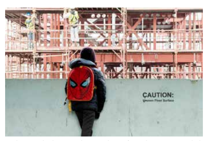
Spiderman checking out his new home from the remaining deck access flats, Pollokshields.