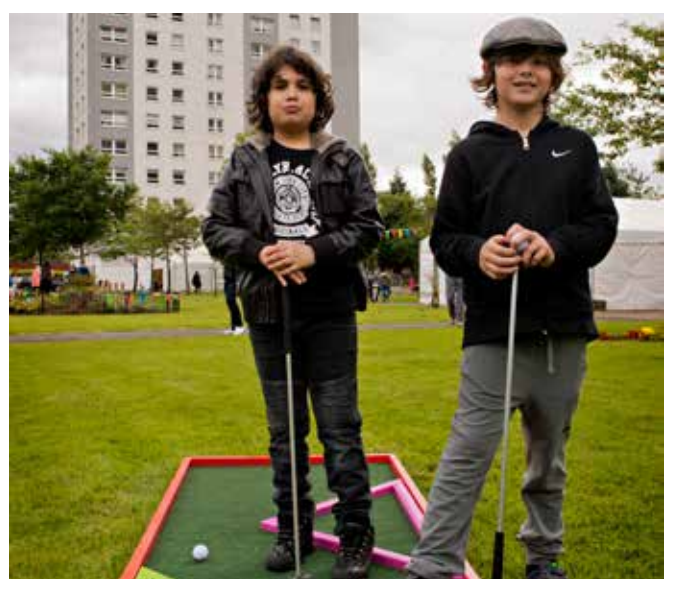
Queensland Gala Day Summer 2017.