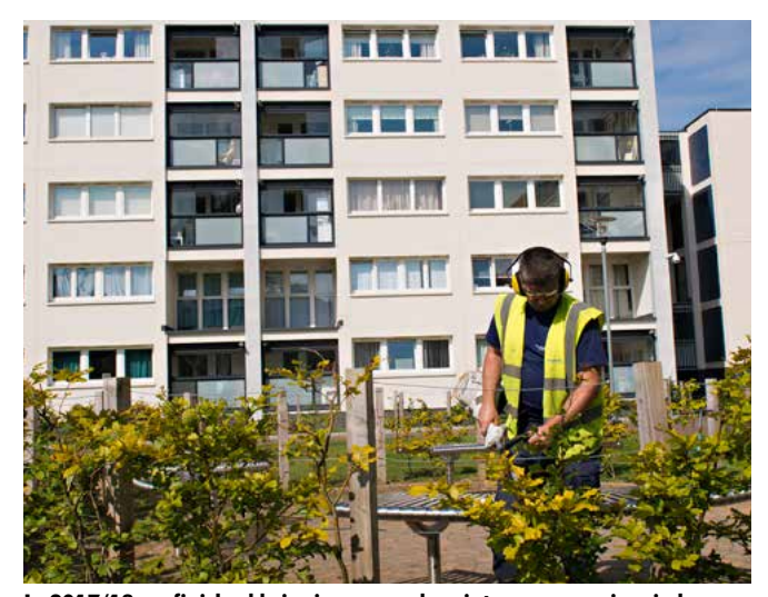
In 2017/18 we finished bringing ground maintenance services in house and this has proved very popular with tenants and owners alike.